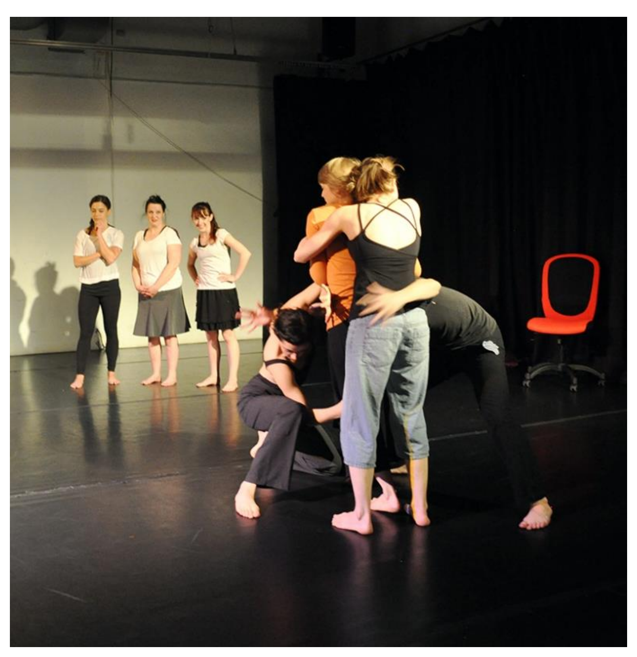
Movement Forum during their improvisational piece titled The Fence, which was danced to the West Side Story Prologue. The dance began with two volunteers joining the dancers, one volunteer was given a chocolate ice cream cone and one was given a vanilla ice cream cone. The dancers split in to two groups to battle to decide which flavor is better.