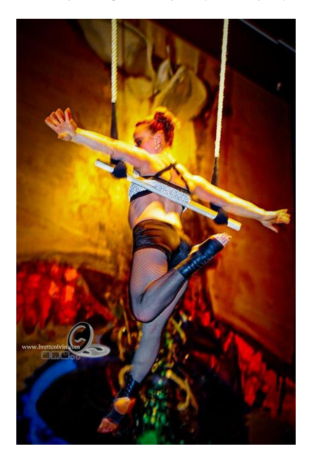
Enjoy free performances by Aerial Arts of Utah.

Get ready to laugh with Toy Soup Comedy Improv.