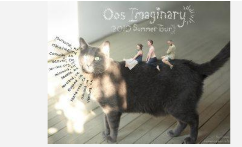
OOSImaginary Performances and Workshop

-The show is still very much improvisational, but we've shaped it into a two-act structure, with an intermission in between. All together, it runs about 90-100 minutes. We have been ambivalent about titling it, but we may decide to shortly, in which case I'll let you know. Without going into the details, it involves a lot of improvised dancing, original music (cello, guitar, percussion, singing, trumpet, & electronic), original text (both prerecorded & spoken), an old hunched curmudgeon, a garden of junk, cardboard boxes, motor oil cocktails, & Oscar Wilde.